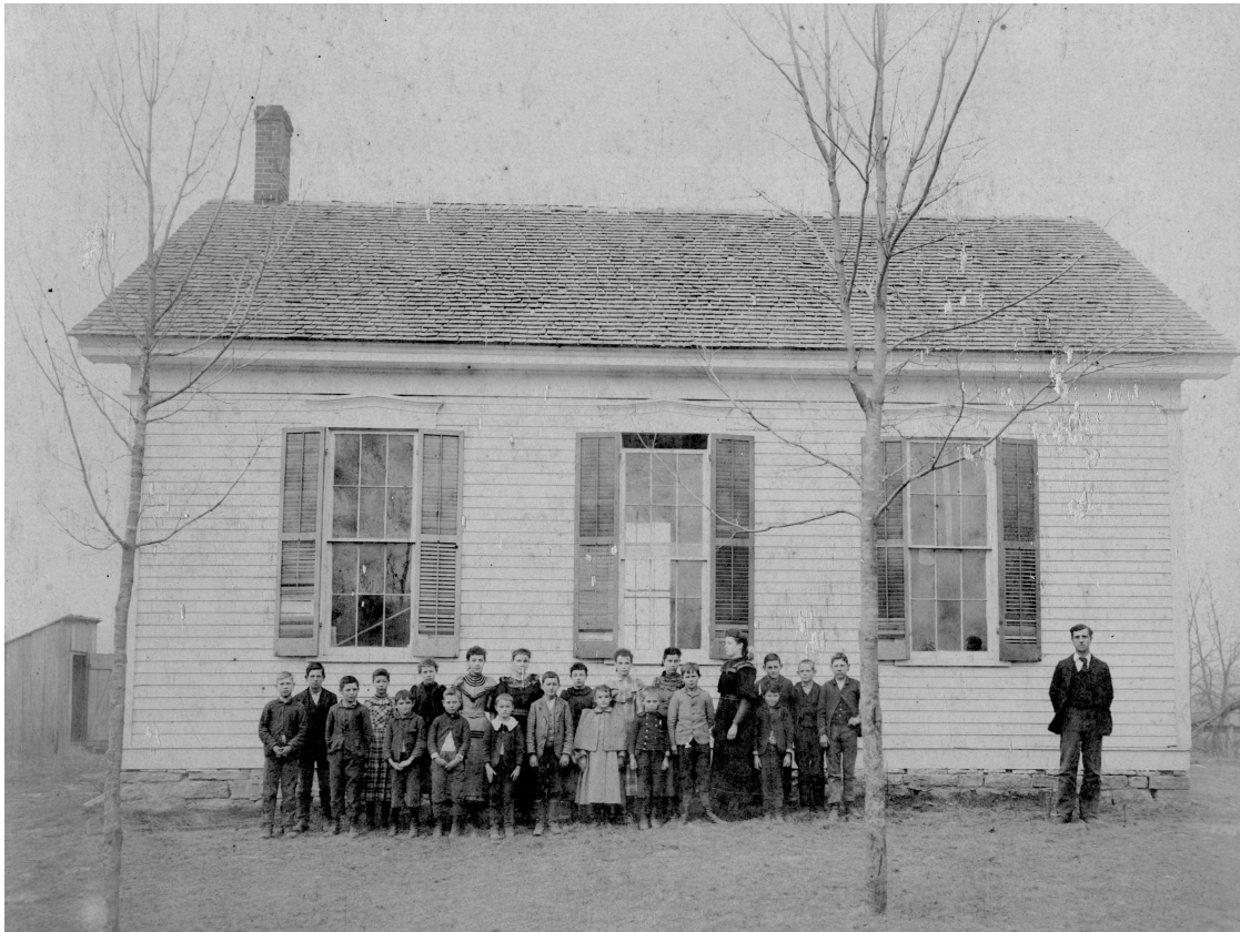
An unknown female teacher and a male administrator

The reason for this paradoxical history of change and constancy is that even as the broader context of education has changed over the past two centuries, the core purpose of the school principal has remained embedded in the center of the school organizational structure. Located between the school and the district, and serving both, the principal has historically been a middle manager who translates educational policy from the central office to the classroom. Assigned both to promote large-scale initiatives and to solve immediate day-to-day problems, the principal has always carried multiple and often contradictory responsibilities, wearing many hats, and moving swiftly between multiple roles in the course of one day. This mobile, multitasking role has always described the work of the principal, even as the nature of those tasks has radically changed.